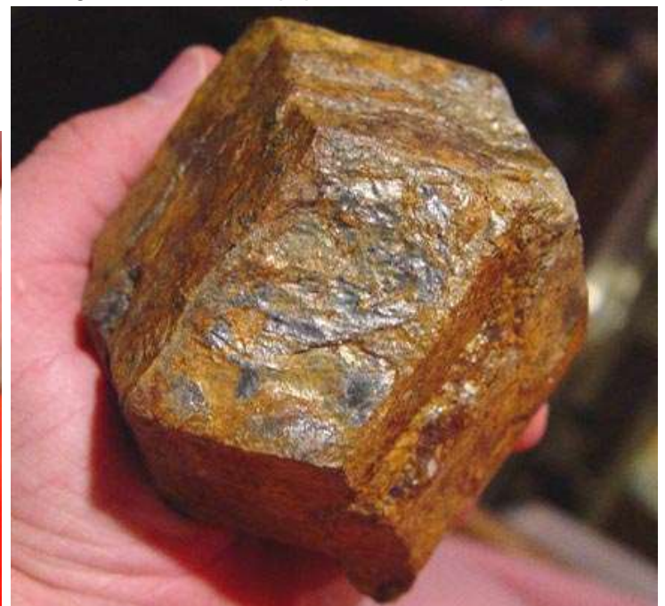
Weight: 5 pounds. Now resides in the Henderson County Museum.