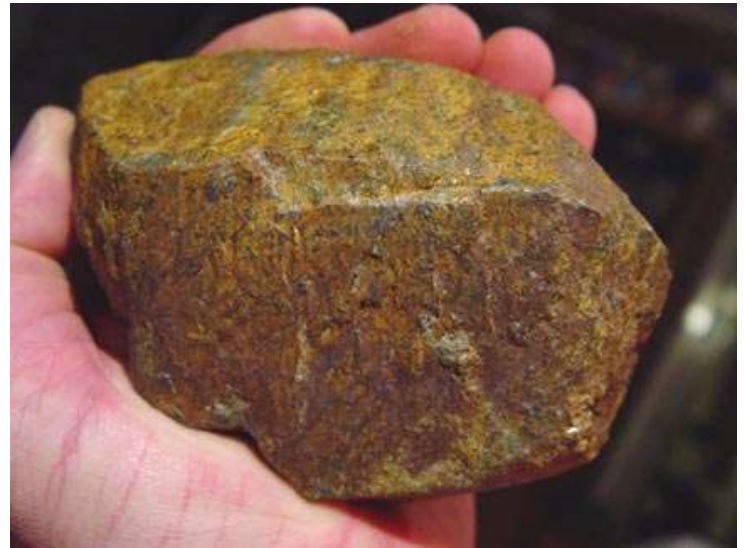
5 pound double crystal.

atoms ended up in the wrong place while the crystal was forming. Either way, they are some of the most unusual garnet crystals in the world.