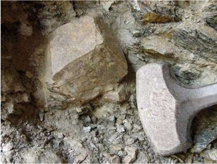
Garnet crystal in matrix rock at the Little Pine Mine.