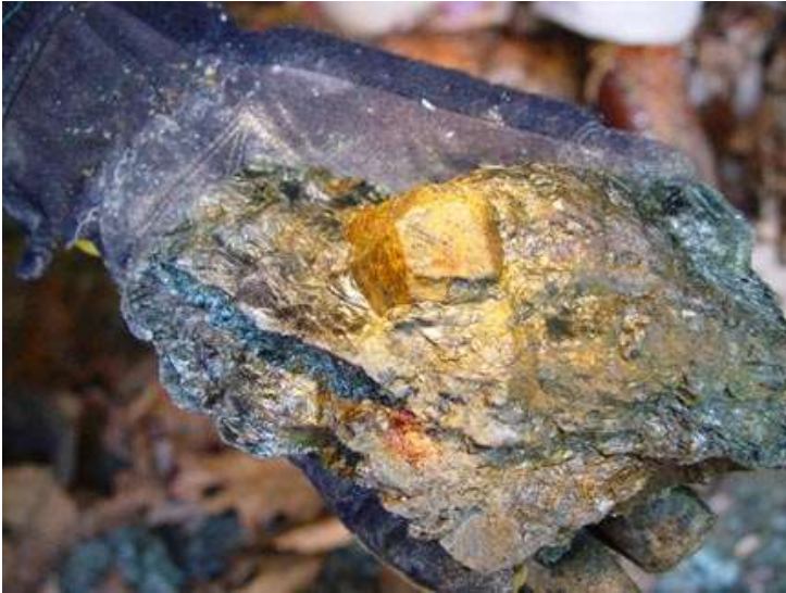
Garnet crystal in matrix just removed from the mine.

promote it as a tourist attraction with his Sandy Bottom Trail Rides. Whether you are a serious rockhound or a casual, curious amateur, you can spend a few hours or a day digging in those spoil piles at the mouth of the old mine or venture into the mine itself. At one time the mine went all the way through the mountain but a cave-in closed off a large portion.