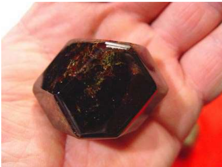
1 pound polished garnet crystal, now residing in the Henderson County Mineral and Lapidary Museum, Hendersonville, N.C.

stones that garnets can be found in) to that Talc Mill for it to be ground up for use in pencils. The talc pencils were what steel mill workers used to mark steel for cutting before newer equipment took their place.