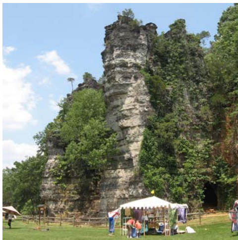
Natural Chimney State Park, Mt. Solon, VA