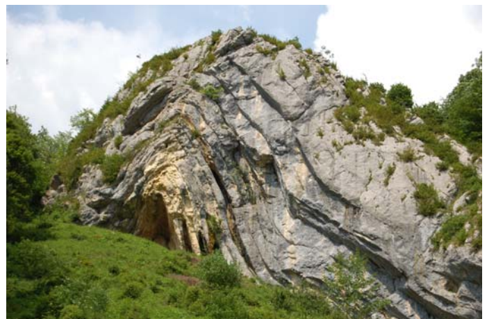
Microfold called the "Gendarme's Hat" in the Jura region of France.