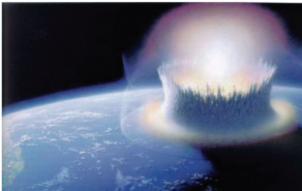
An asteroid slamming into Earth at Chicxulub in what is now Mexico in an undated artist's rendering. A giant asteroid smashing into Earth is the only plausible explanation for the extinction of the dinosaurs, a global scientific team said on Thursday, hoping to settle a row that has divided experts for decades.